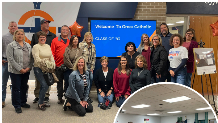
Above: Class of 1983