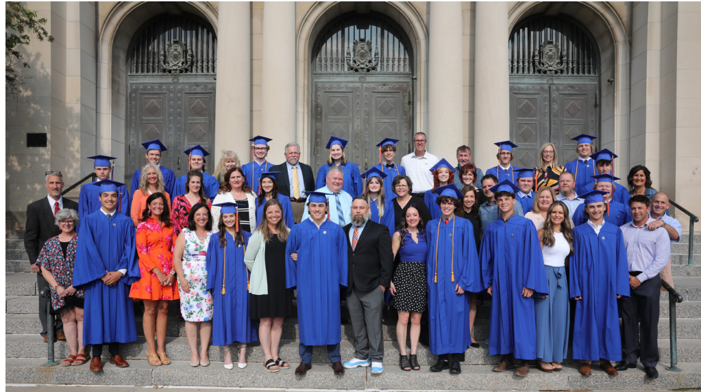
The Class of 2023 and their Legacy Parents

I am so grateful to those who donate what God gives them, so that children like mine have the opportunity for a better education that strengthens their faith. Thank you for being willing to help in one way or another. May God bless you all abundantly."