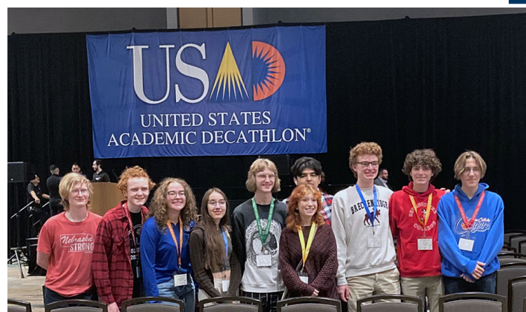
2023-2024 Academic Decathlon Team