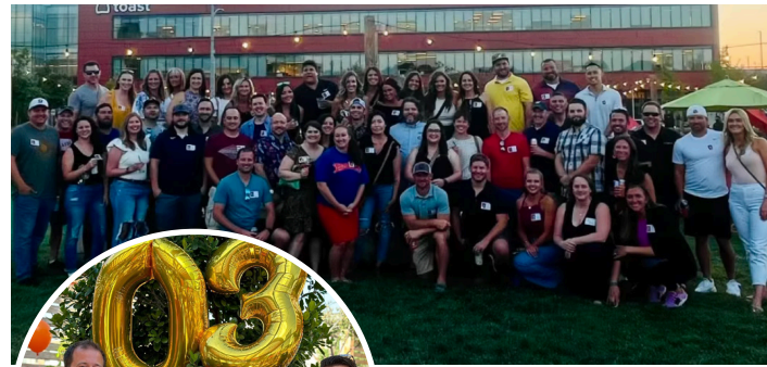
Above: Class of 2003